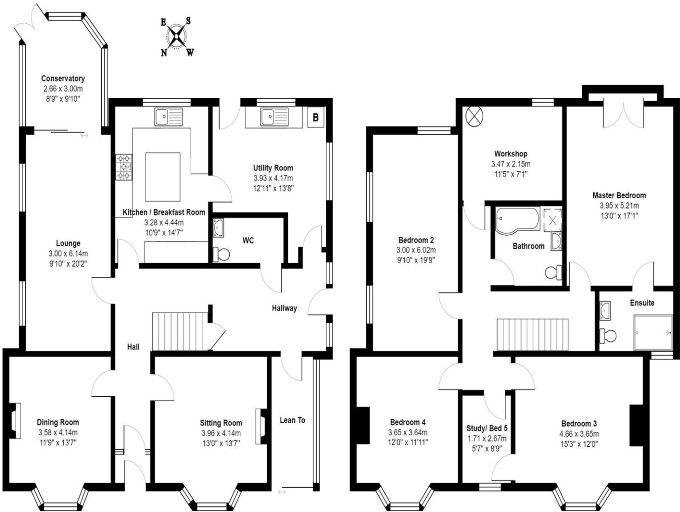
Area: 120.8 m 2 ... 1300 ft 2

THORNBURY With an estimated population of approximately 15,000, Thornbury has everything you might hope for in a town of this size. A pretty High Street has a variety of shops combining national names and local independent stores, and these extend through into a small shopping arcade. There are two supermarkets, a library, golf course, tennis courts and a large leisure centre with swimming and diving pools. Schooling is provided by five primary schools and Thornbury Castle School provides secondary education. There are also two schools specifically for those children with special needs. Thornbury also benefits from a number of great eateries, from pubs to cafes and cafes to fine dining restaurants.